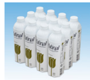
3x4 14–18 tray/min. WASF or shrink.