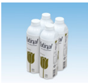
2x2 42–54 tray/min. WASF or shrink.

A complete system for conveying to the palletizer.