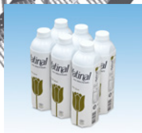
2x3 28–36 tray/min. WASF or shrink.