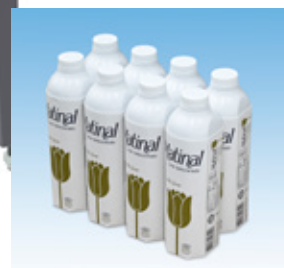
2x4 21–27 tray/min. WASF or shrink.